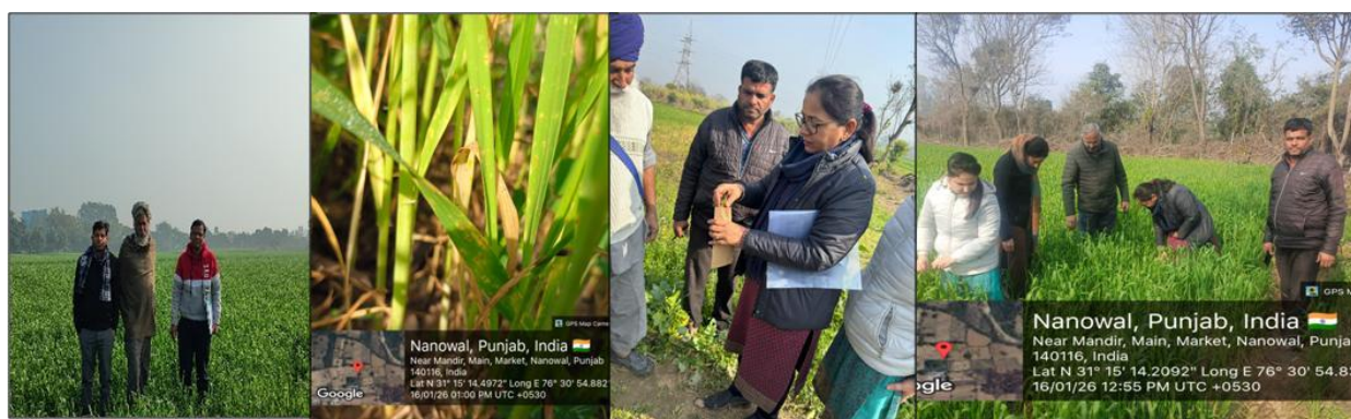
Table 1. Details of wheat rust survey locations and disease status in Punjab